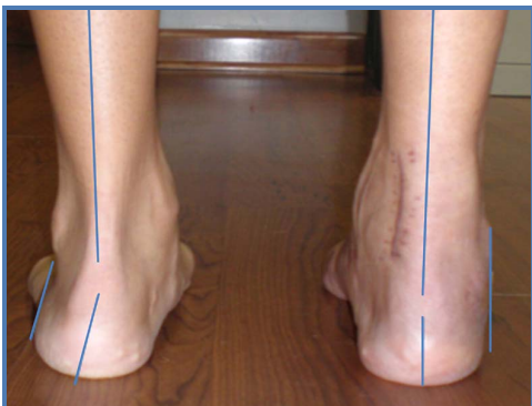
FIGURE 8: Frontal Hindfoot Correction