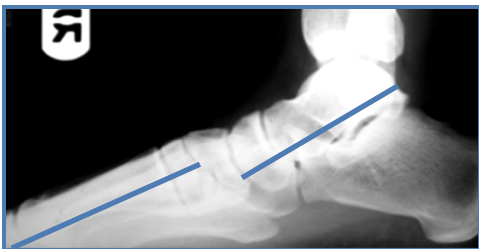
FIGURES 1 & 2: Pre-Op X-rays, AP & Lateral

Treatment options should begin with conservative measures. Many patients benefit from a custom arch support and physical therapy to alleviate soft tissue contractures. However, if pain and deformity persist, the treating physician should consider surgical correction of the deformity. Upon surgical evaluation, the surgeon must consider the differing planes of deformity and address both soft tissue and osseous structures. 1