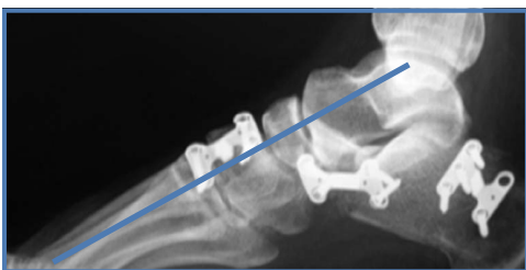
FIGURES 6 & 7: Post-Op X-rays, AP & Lateral