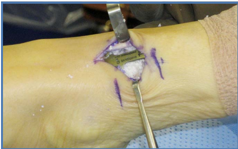
FIGURE 5: Cotton Osteotomy